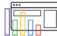
Digital Marketing & eCommerce